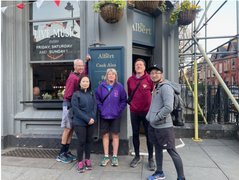
The trail was beautifully marked and no-one got lost.