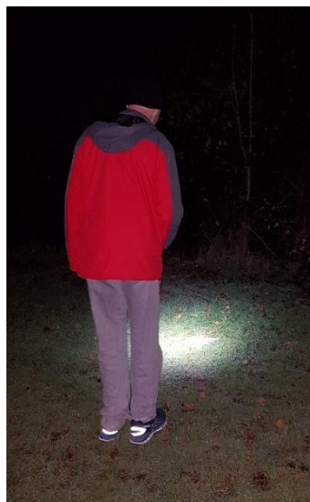
ET tentatively discovering off-roading.

A lot of confusion arose when the trail went off-road. The shredded paper was not initially spotted.