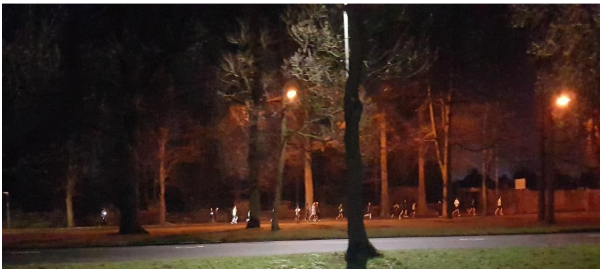
Rival group spotted

Another more dynamic running group were spotted on the streets – Penny Lane Striders.