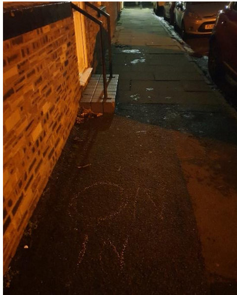
One of the two On Inns on offer

Victim had been absent for the majority of the run – it was realised that he had mistakenly returned to the Masonic for refreshments, expecting the down downs to take place nearby. He also spotted that there were two separate On Inns.