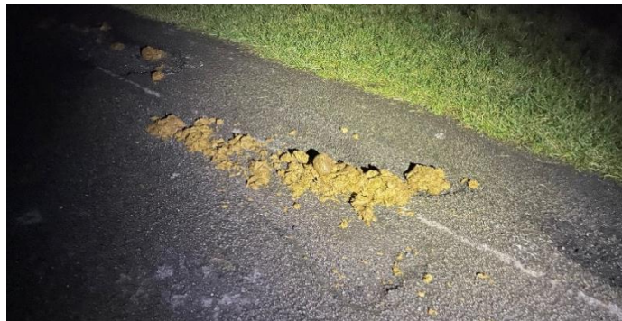
Glad not to encounter any of the local dogs

A lot of confusion arose when the trail went off-road. The shredded paper was not initially spotted.