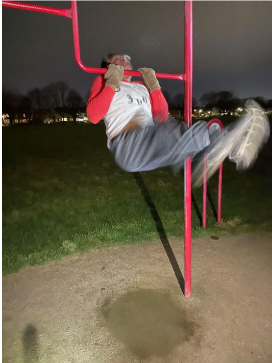
I believe one 'Pull Up' was achieved by FCUK - Note the excessive pool of sweat.

There was an opportunity to 'Show Off' on the gym equipment located on Long Lane Recreational Park. Balancing on a beam or 'Pull Ups' were beyond the capabilities of most.