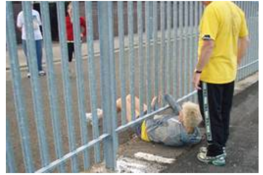
An awkward moment occurred when the trail markings were taken too literally