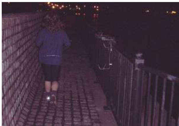
and up Brunswick Avenue to the roundabout where Compo decided that he wanted a photo of the W**ker (or did he say anchor?)