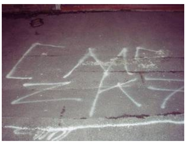
Down Stanhope Street and Mariners Wharf to the Docks. Along the Wharf

Your scribe was confused about these markings until he realised they had been made with paint and not flour.