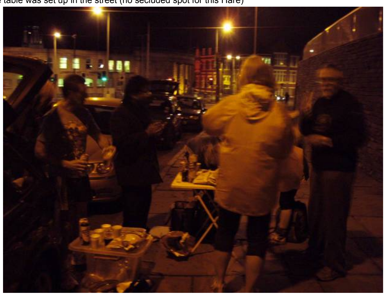
The table was set up in the street (no secluded spot for this Hare)