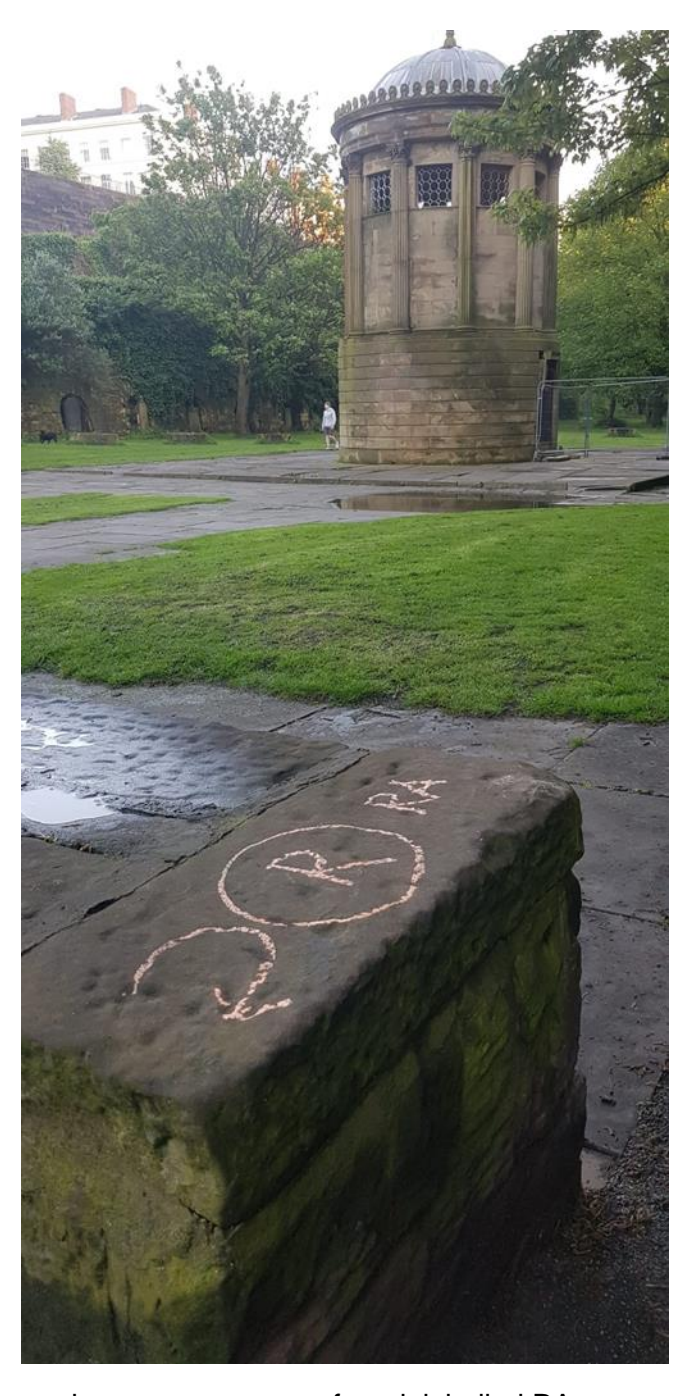
...where a regroup was found, labelled RA, very appropriately with the cathedral looming up behind.