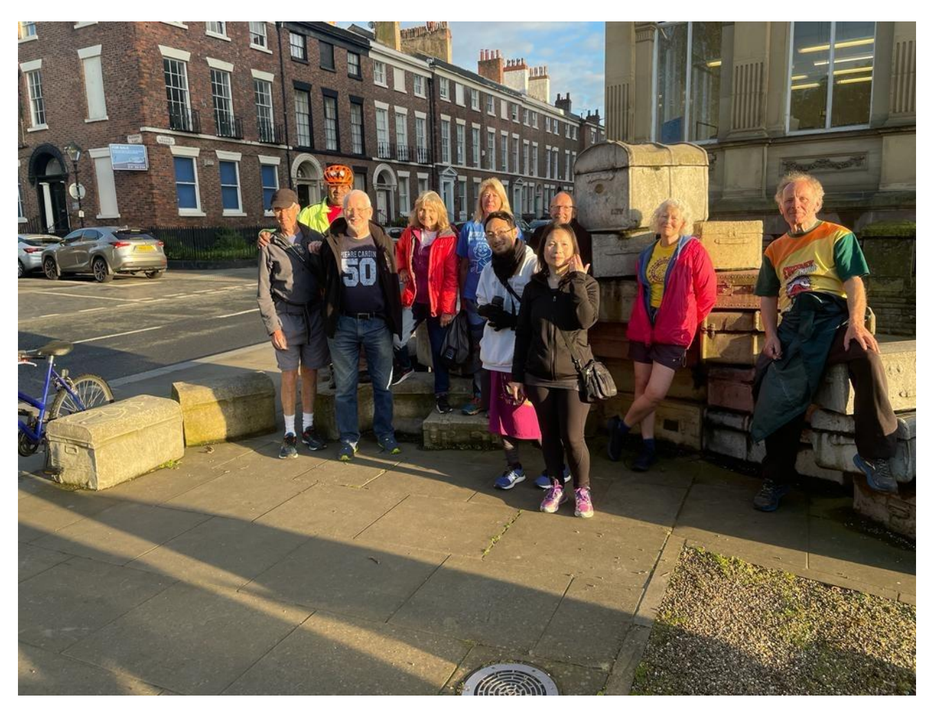
The trail now led along Hope Street and then down Canning Street and into the cathedral forecourt.