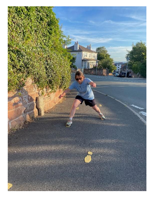
Following in the footsteps?