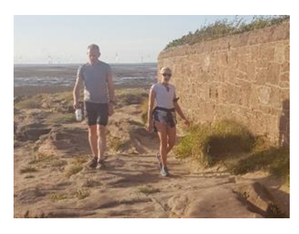
Late Arrival (On Right)