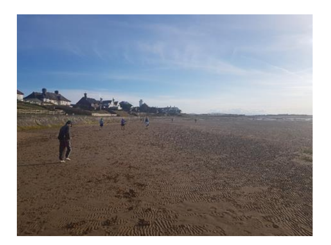
Had the beach to ourselves - Noted that all sufficiently distanced

There was a natural inclination for the pack to lean towards the coast which was eventually found. Ventured over the Royal Liverpool Golf Club – Nowhere near Liverpool?