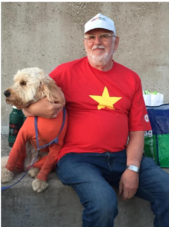
Victim - missing Luna - took a liking to a dog belonging to T-Bag and T-Lady