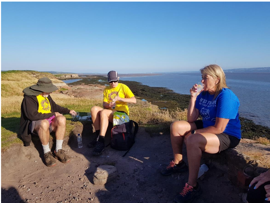
On passing Middle Eye we stopped again for Gin and Tonic on the rocks which made the onward stretch to Hilbre pass considerably more quickly...