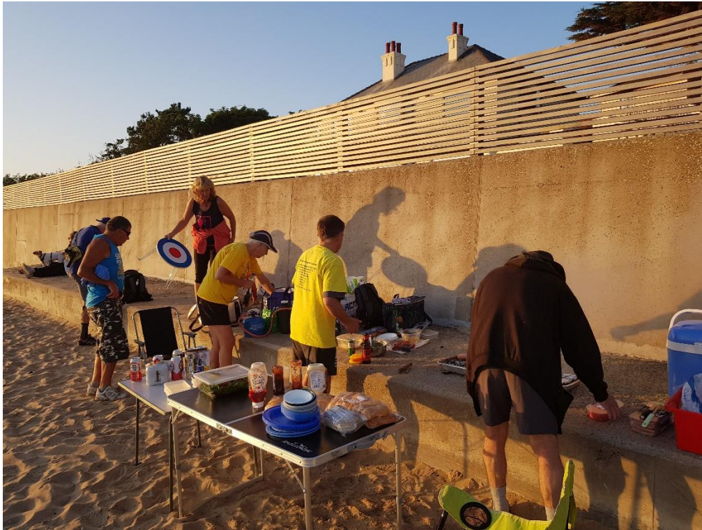
Food was served just as the sun was setting ....