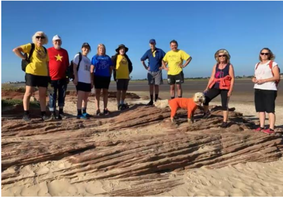
We stopped for a regroup (on Little Eye?)