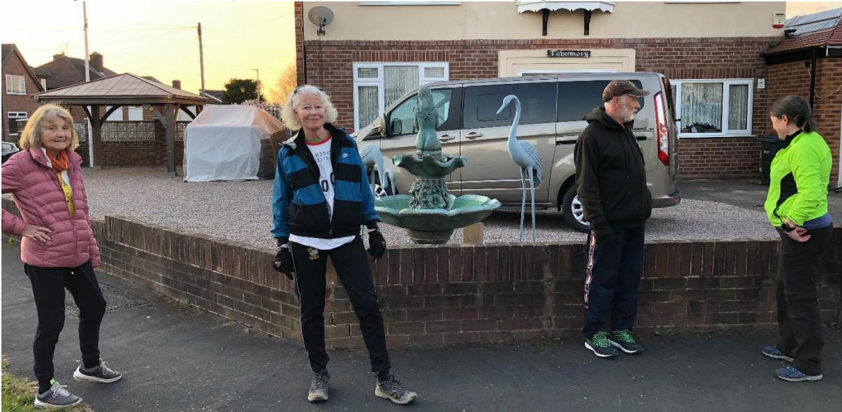
Ostentatious garden furniture on display

It had been dry for a few weeks, the welcoming sunshine was misleading – additional clothing was donned as the evening progressed. Managed to complete the course with dry feet on grounds previously associated with more challenging water features.