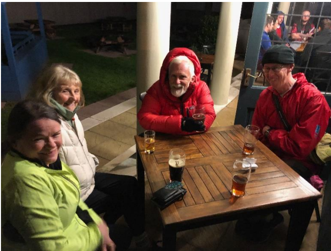
A summer drink on the terrace – suitably attired

Retired to The Countess pub. The rush for the booking of tables had not been necessary. Most sensible drinkers seemed to have gone home once the chill of the evening took hold.