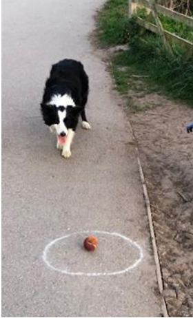
Apprehensive dog (Not one of ours) in Countess Park

Hash flash completed then straight to the platform where ET recently had alighted his train – Disappointingly it was not to be one of those mystery hash train trips. The route moved onto the suburban desert on the other side of the tracks.