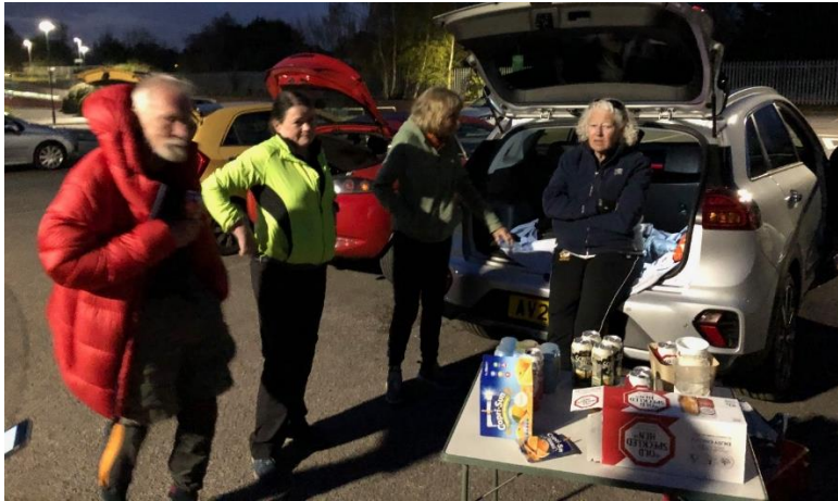
Only a drinks menu on offer this evening.