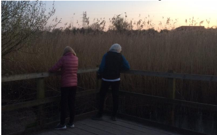
Well I can't see anything wild?

Also visited the Chester Wetlands Project. Apparently Kingfishers and Herons can be seen. Obviously too cold for them this evening.