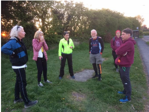
Beer venue negotiations (This is why we all look serious).

Ventured into Countess of Chester Country Park and followed the Poppy trail which was established in 2018 to mark 100 years since the end of the First World War.