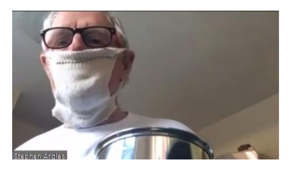
Eventually he donned the sock...