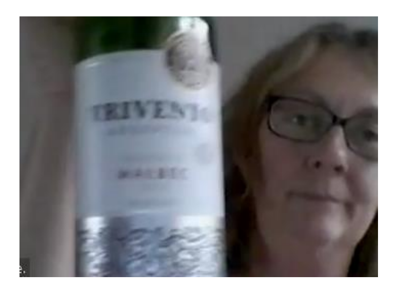
Sticky Rice: Trivento Red Wine