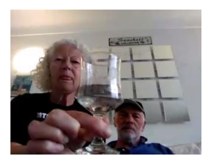
Snoozanne produced hers...