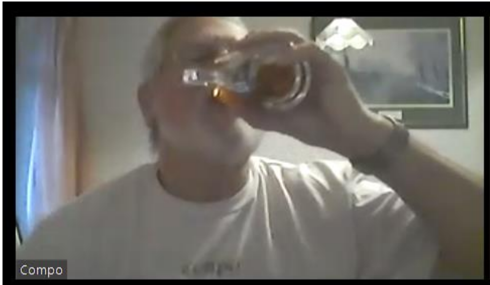
Compo: This week's Wooden Spoon award.