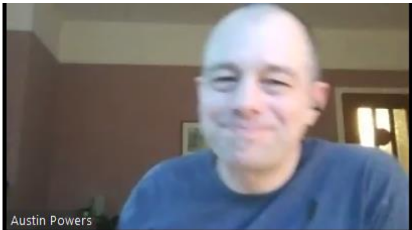
Austin Powers: for the most distant hasher.