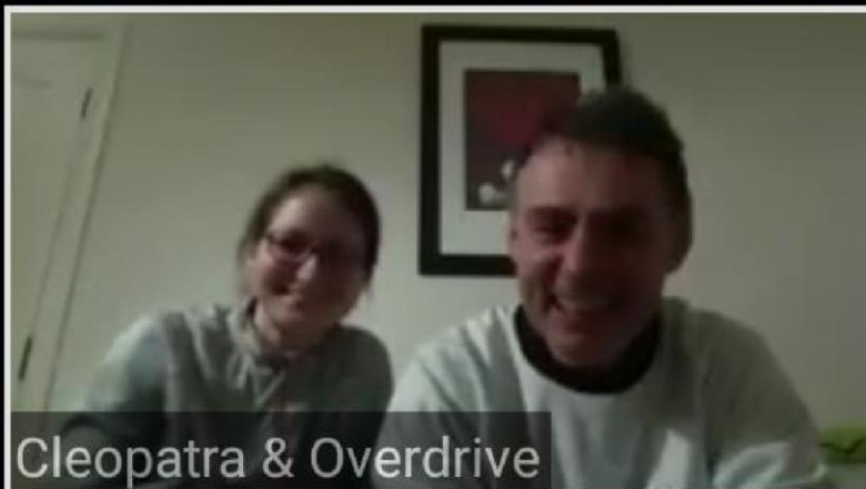
Cleopatra & Overdrive