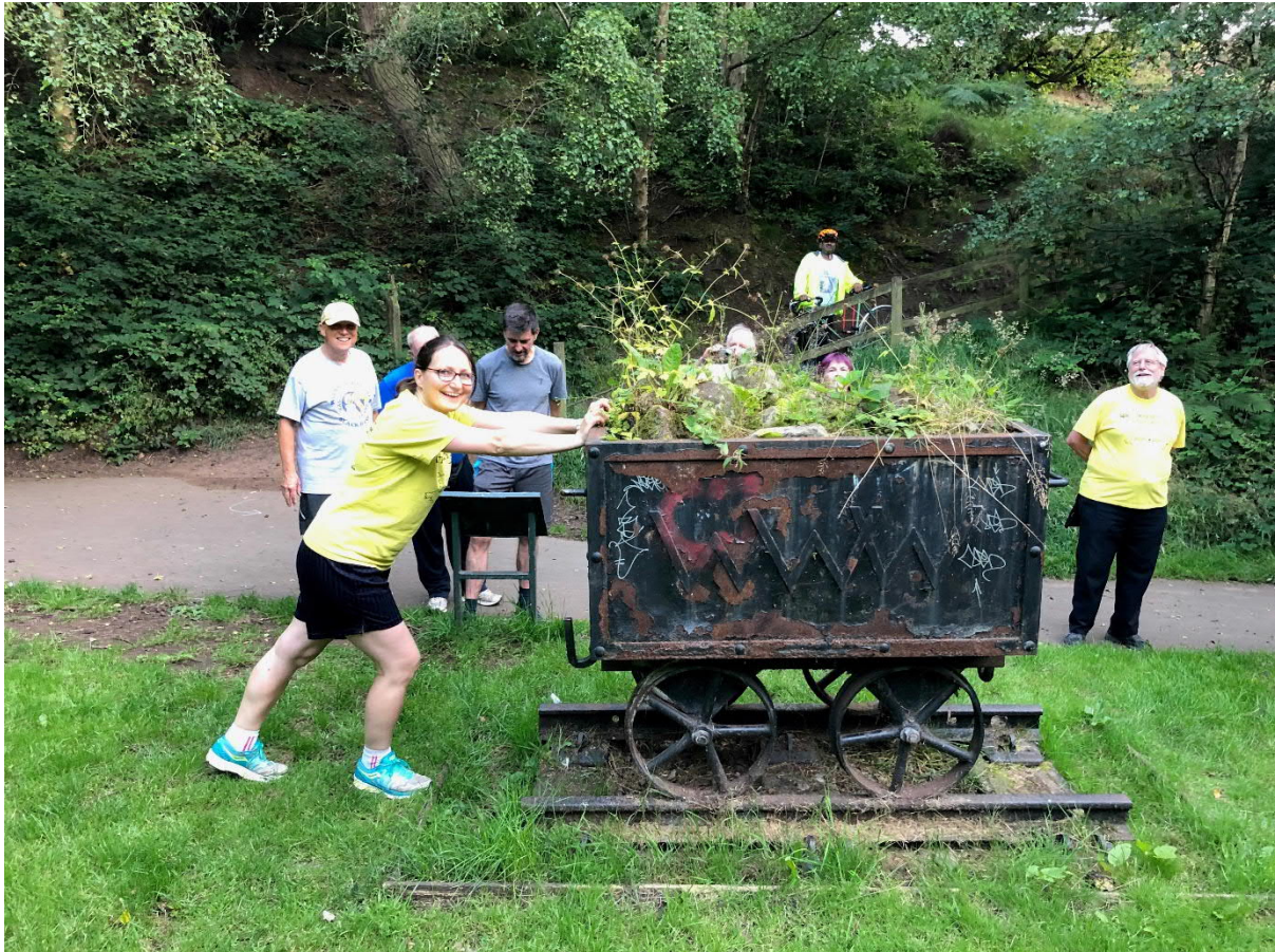
The Hare's original route plan was frustrated by these