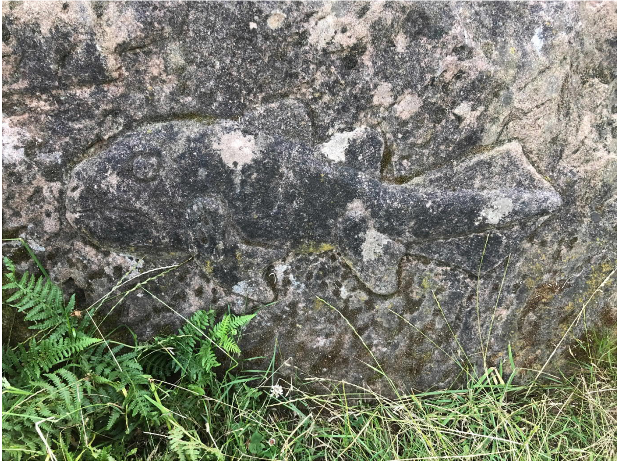
Coming out of the Reserve