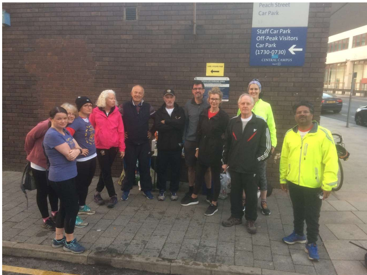
End of run Hash Flash