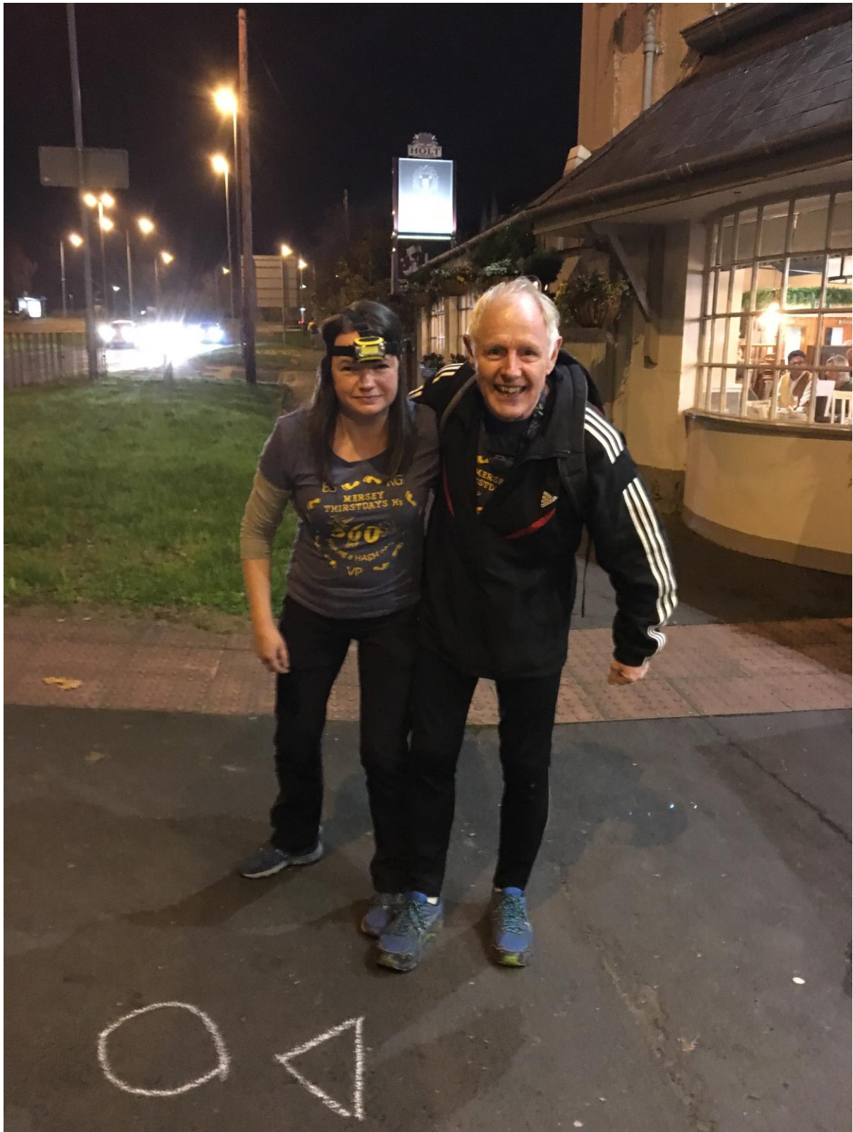
Virgin-on-the-Ridiculous and Carthief (both with dodgy legs/ knees) reckoned that they might go quicker by combining their legs