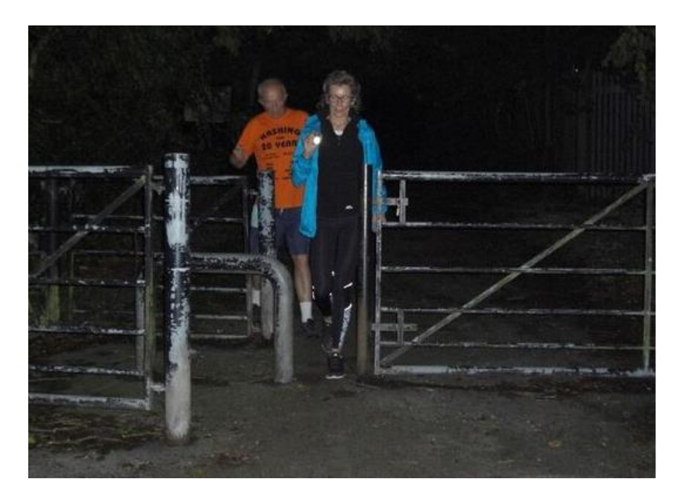
the trail took us down some steps,