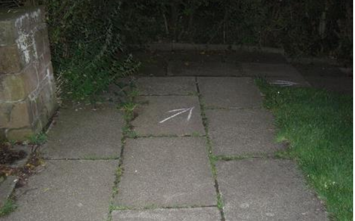
and more marks, clear but perhaps not ON THE RIGHT? Through John Alderman Village gardens we went (possibly before these steps but Liverpool area geography is not my strong point).