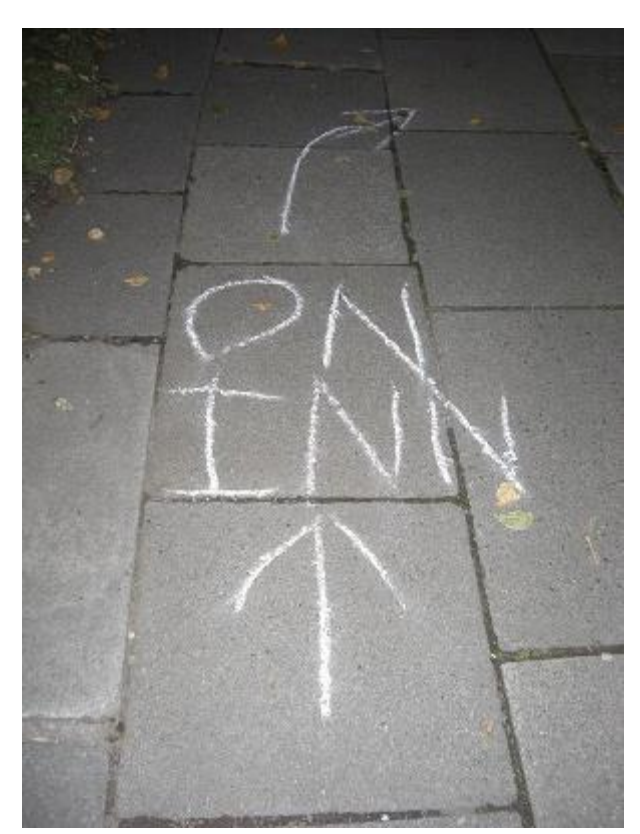
Shortly later, a welcome sign, plus some extra help from the hare: