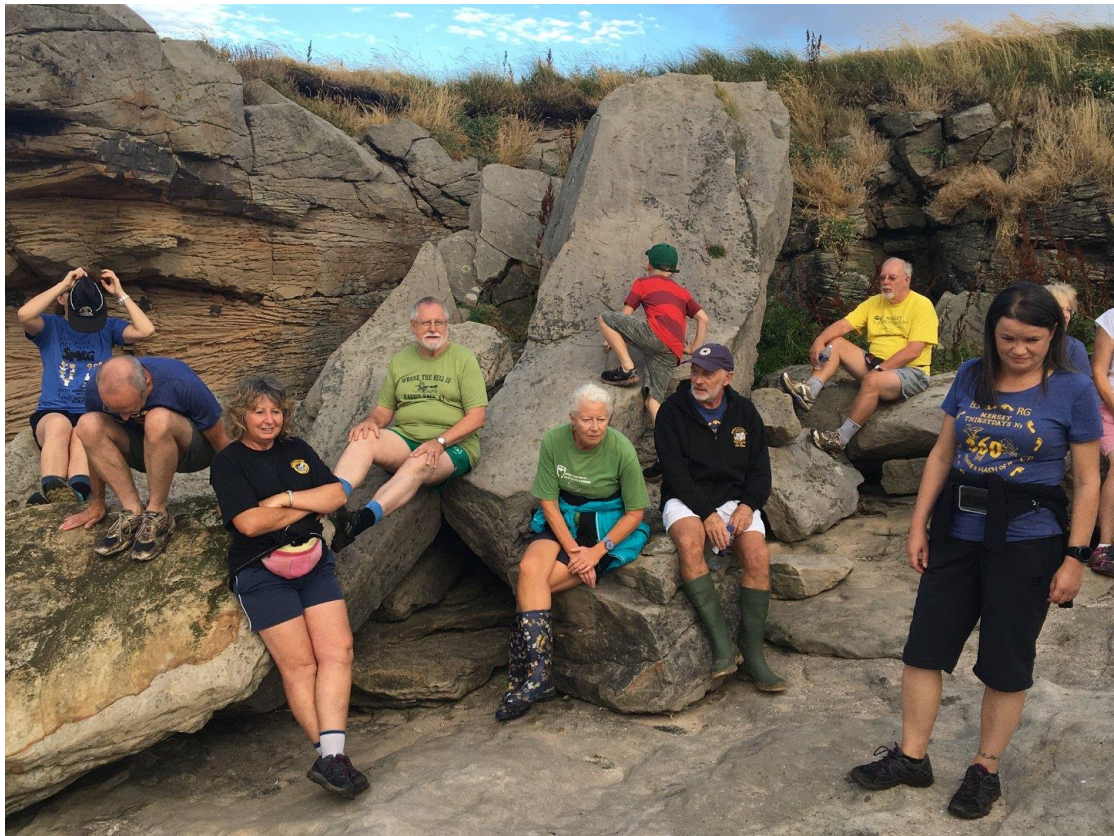
A sheltered nook was found at the far end,