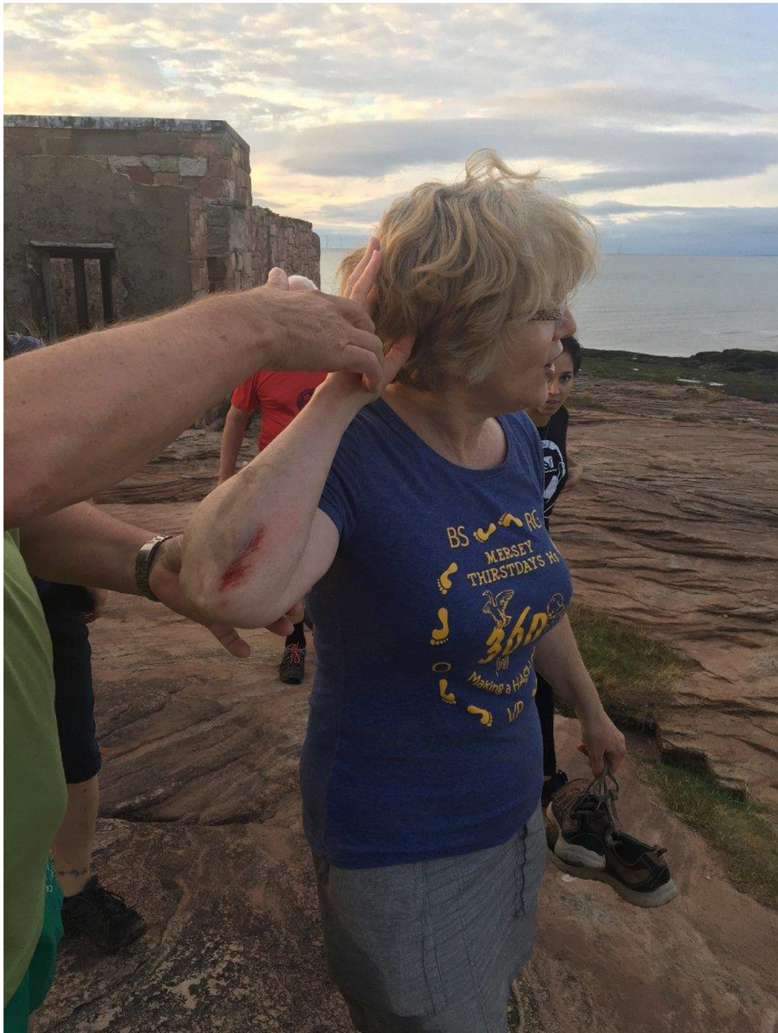
producing quite a nasty gash on her elbow, which she put a very brave face on.