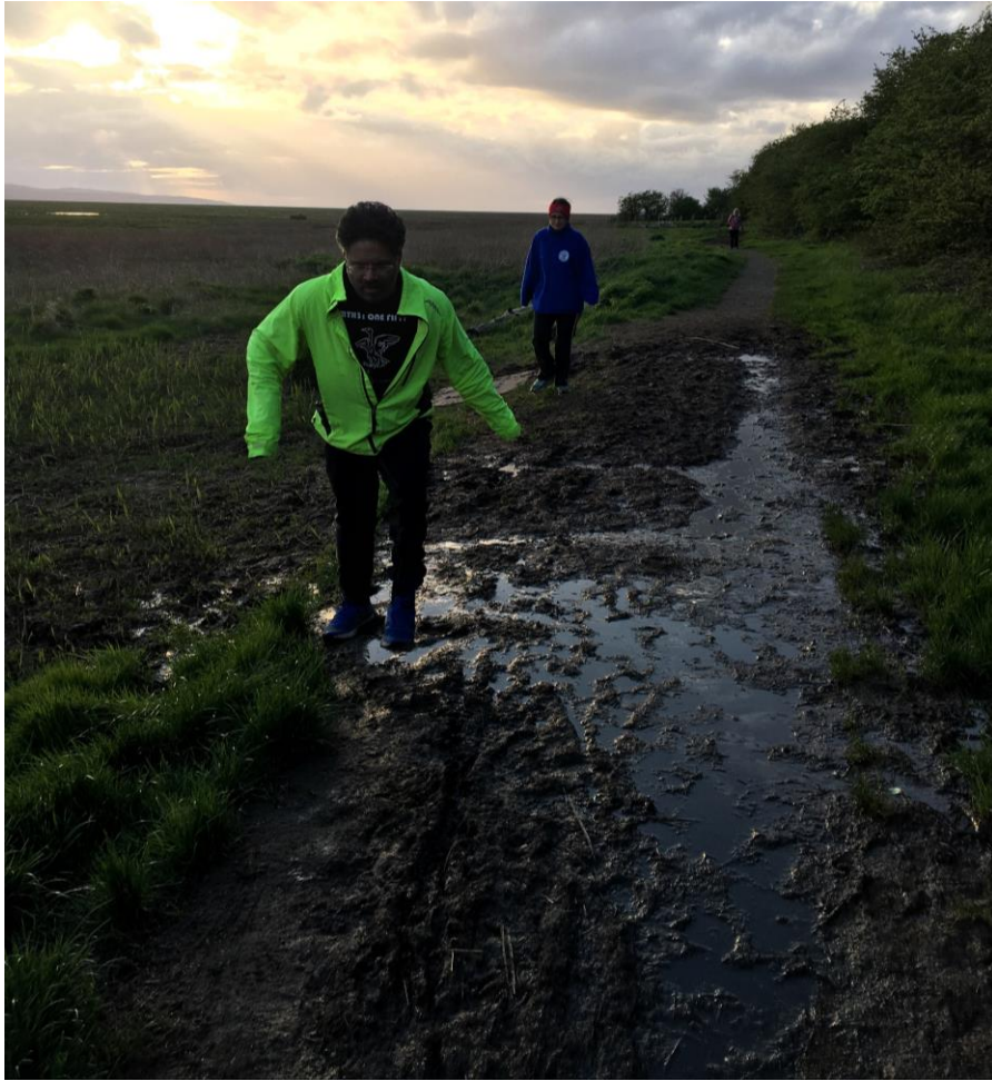
before the Pack arrived at a Check