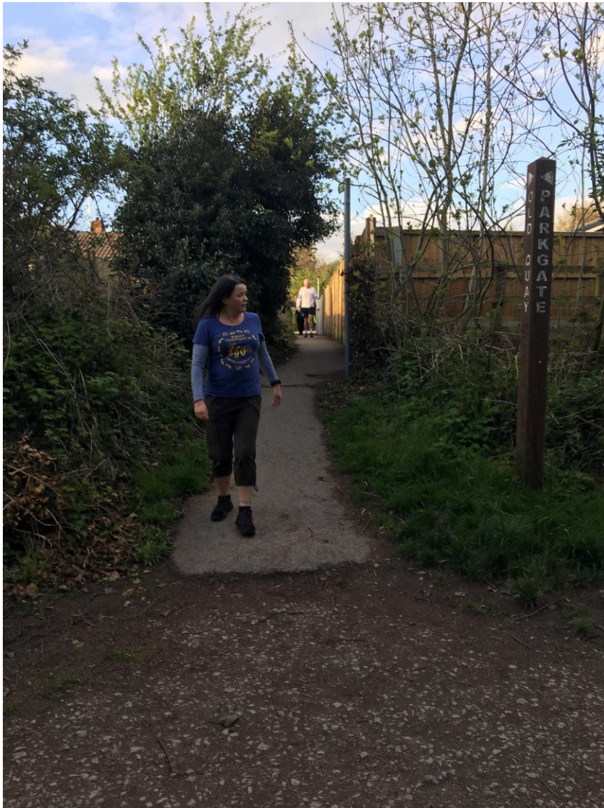
Across the Wirral Way and onto a muddy gate