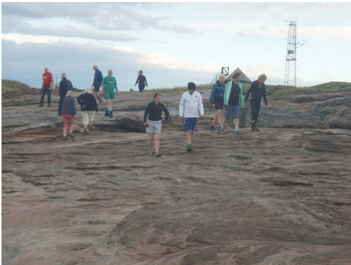
Welsh Maid made it to the top