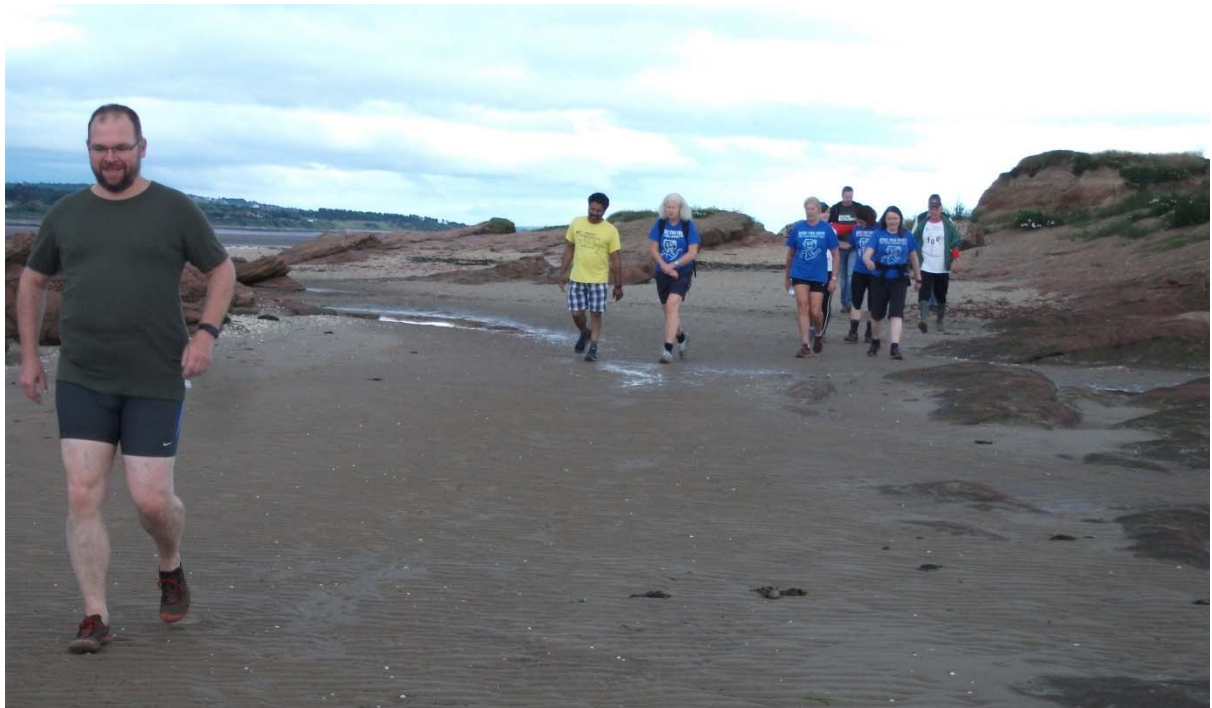
And a scramble onto the top