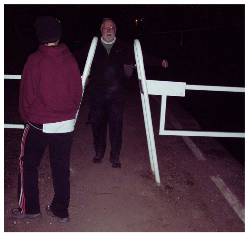
Some more devious Checks, false trails and a hole in the wall

Along the canal with a challenge to the Hare (this relates to an incident in Run 102 where Compo was defeated by a gap (click on embedded file)) http://merseythirstdayshash.com/resources/Run102.pdf