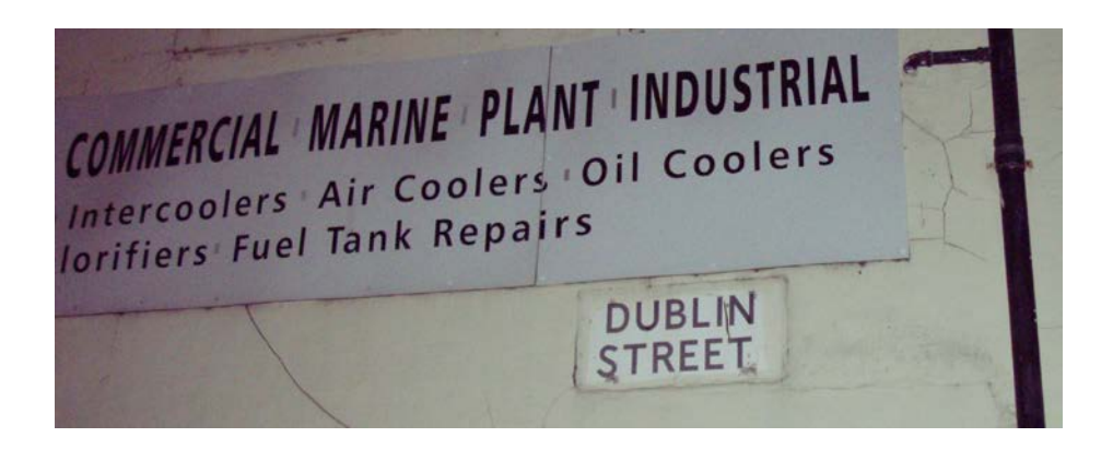
Past the Titanic Hotel (SS Titanic was built in Belfast)