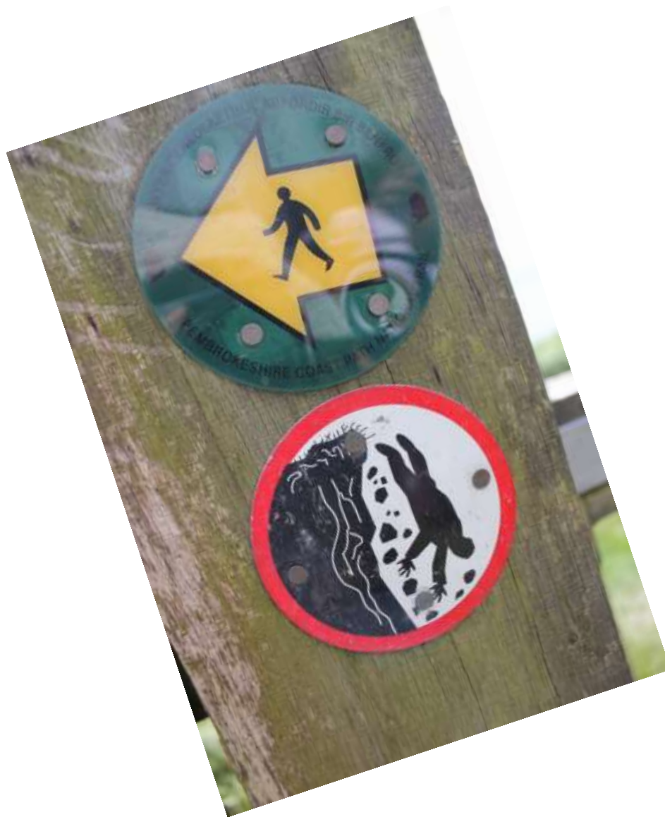
Falling off a cliff' sign