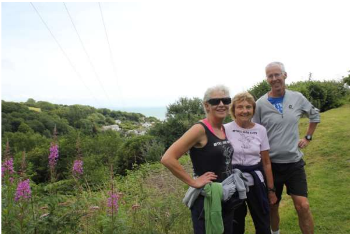
Emerging after Colby Lodge Valley and seeing the sea for the first time on the run. FCUK contemplates taking the cable car (can you see the lines)