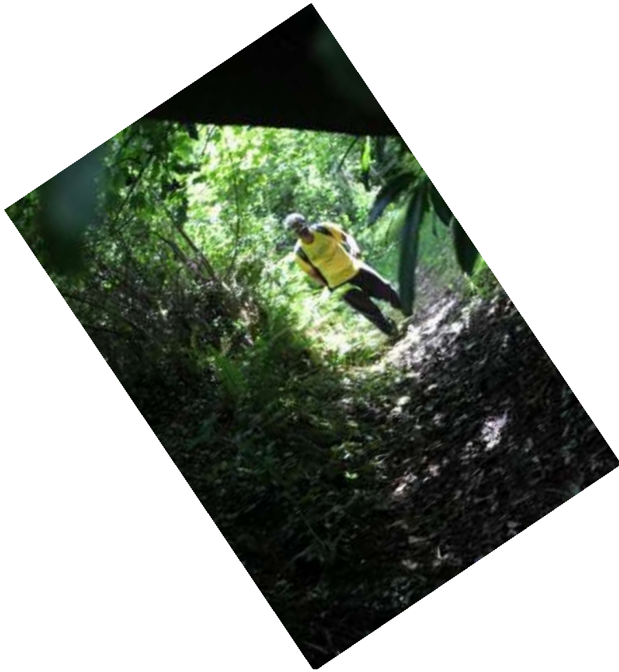
Shiggy! In green tunnel one