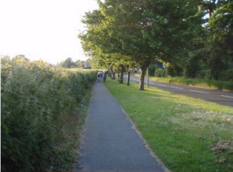
The trail led via Littleton to emerge finally in Christleton where we occupied the gazebo thingy in the centre of the village.

to emerge on the appropriately named Hare Lane. This led us over the A55 and across the A51 into the real Cheshire countryside; fields, trees and everything.