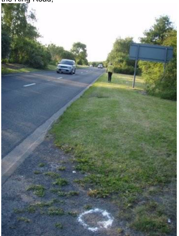
A Ring on the Road where we ducked through a hedge and across a field