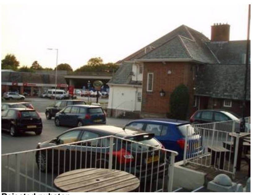
Rejected pubstop and where we met a splinter group of shortcutters who feigned ignorance of having missed out a large loop.

We sallied forth with new vigour and eventually found ourselves returning along the canal; past the originally intended pubstop which did indeed look slightly grim,