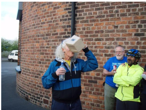
Snoozanne will go to any lengths to avoid drinking beer

Down downs were awarded to the following: