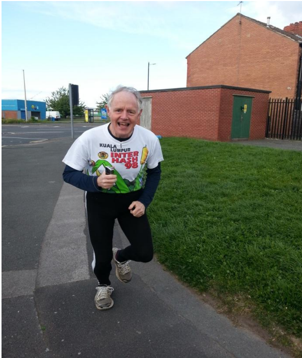
CT enjoys the start of the trail