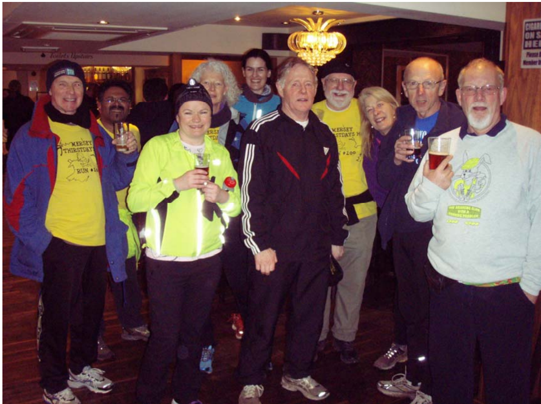
A quick look at Compo's motto