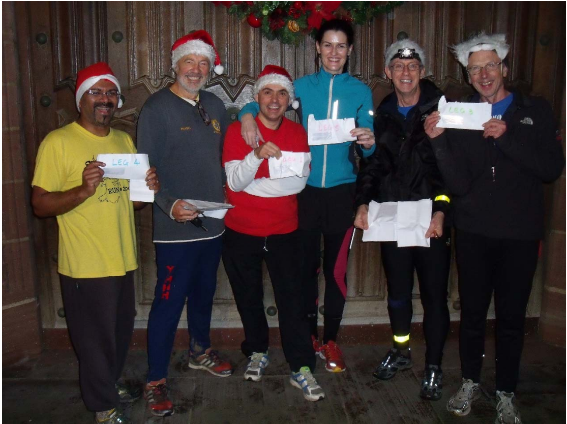
The Hare and Virtual Hares