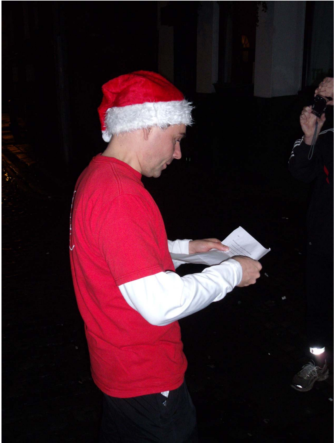
The Pack went off following the Hare with several interruptions as he absorbed the information.