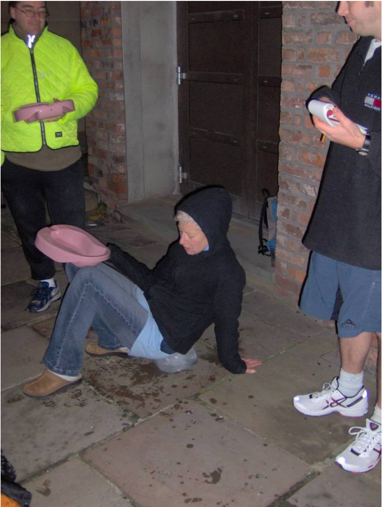
A solemn moment as Snoozanne took to the sacred ice. Shortly afterwards she argued that 'Hog calling time in Nebraska' is a silly song. Quite agree – and not at all in keeping with drinking beer out of a bed-pan whilst sat on a block of ice during a high latitude winter.