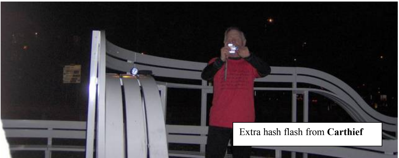
Extra hash flash from Carthief

Virgin Emma and knackered Compo , and over-excited to be gay Austin Powers were pleased to take a pew on the first of the art pieces visited on this cultural extravaganza of the Liverpool bi-sexual festival.