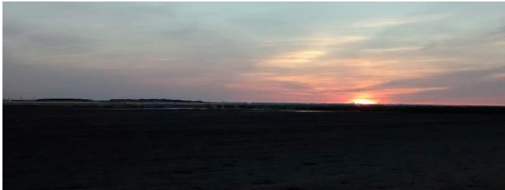
Yes, that's Hilbre island over there