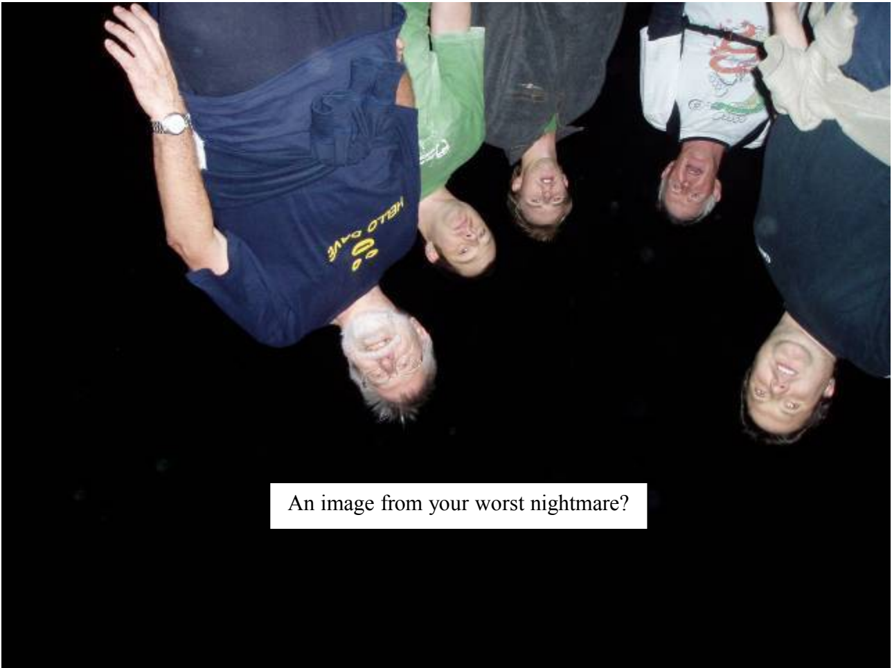
An image from your worst nightmare?