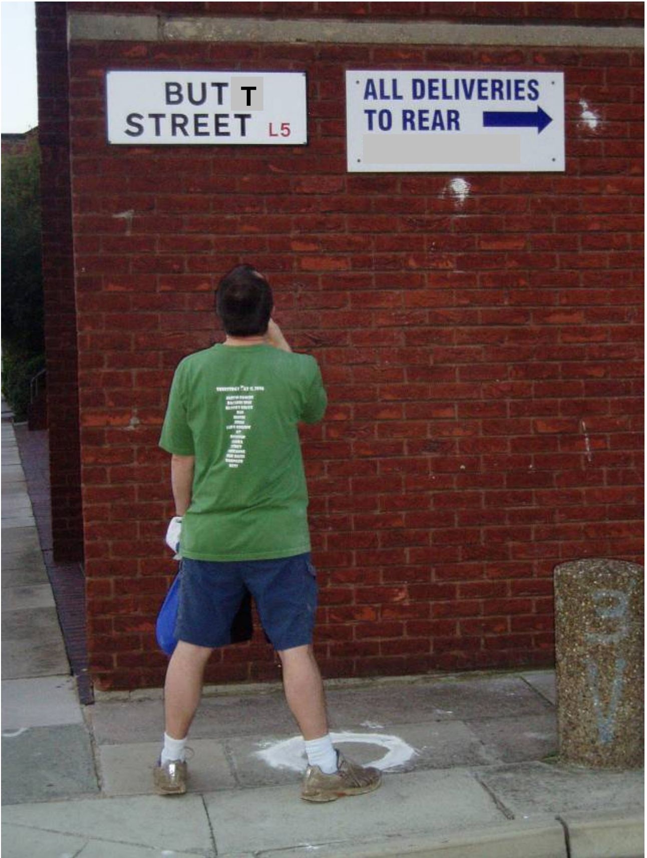
..but nothing had prepared Carthief for a 'rear entry at Butt street' (the hares are always looking to provide new experiences for the MTH3 pack)