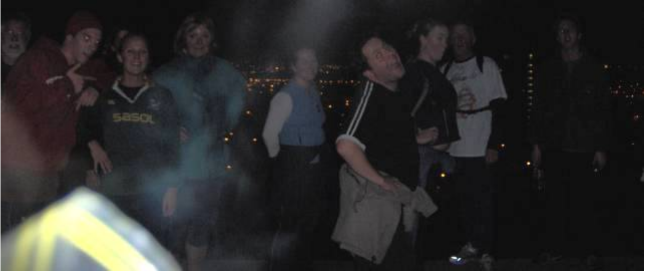
Admiring the camera flash at a local beauty spot