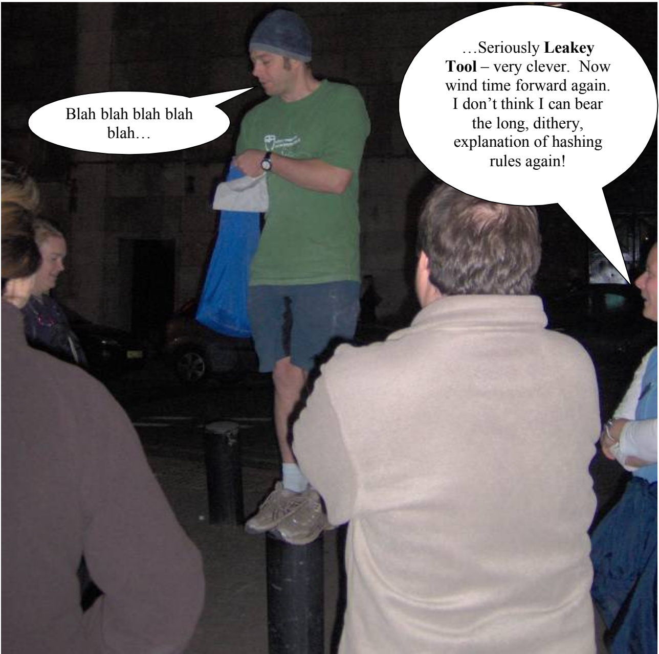
With everyone clued up we set off. Carthief had come equipped for a night out nicking in town...