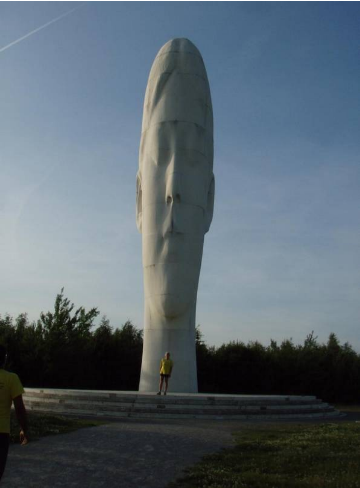
Wigan Pier posing with The Dream

http://en.wikipedia.org/wiki/Dream_(sculpture)