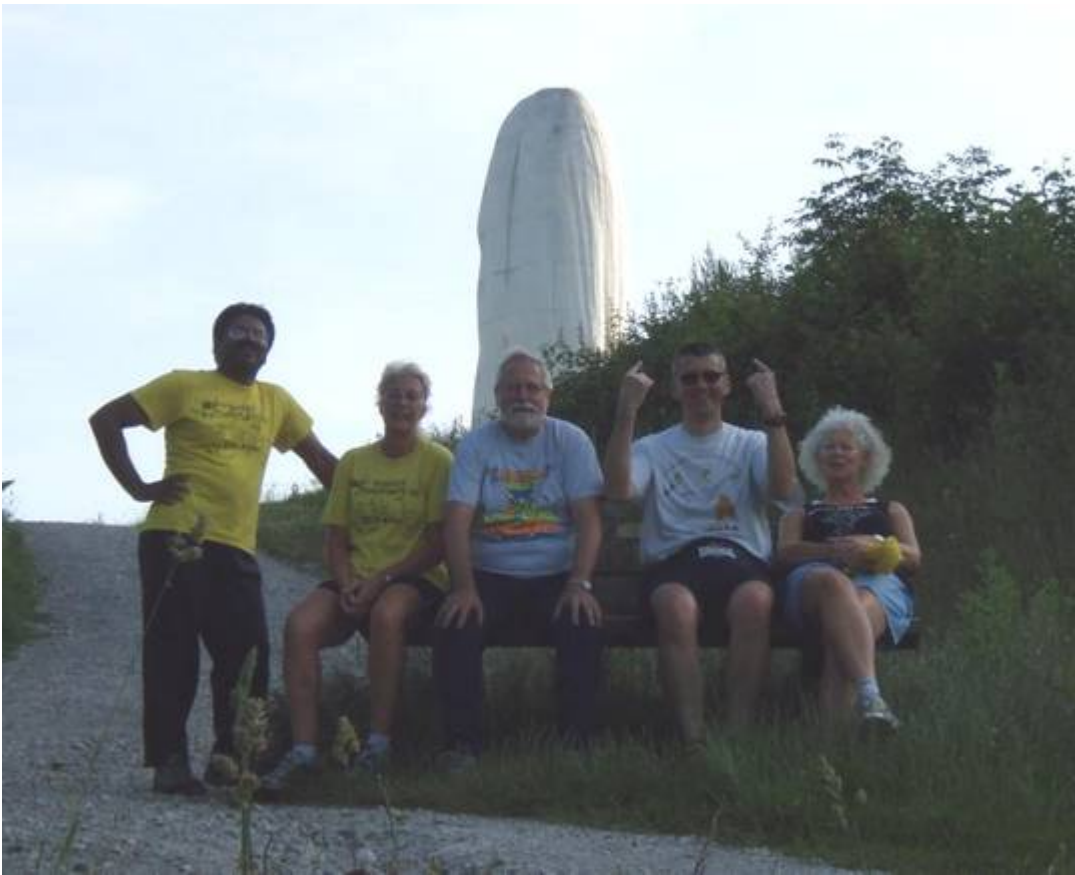
Coming round to the other side of the sculpture