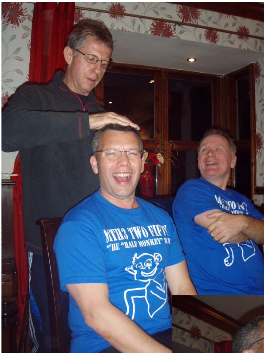
Menage a twat