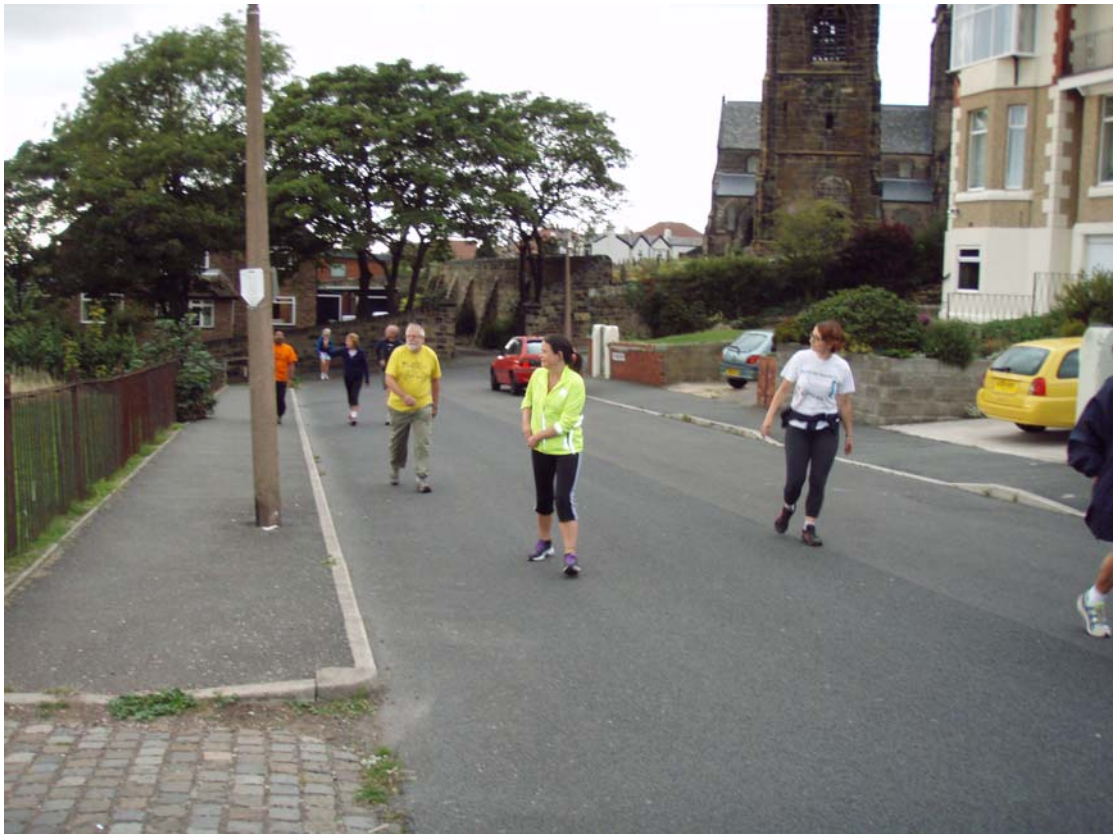
Compo in the tramlines