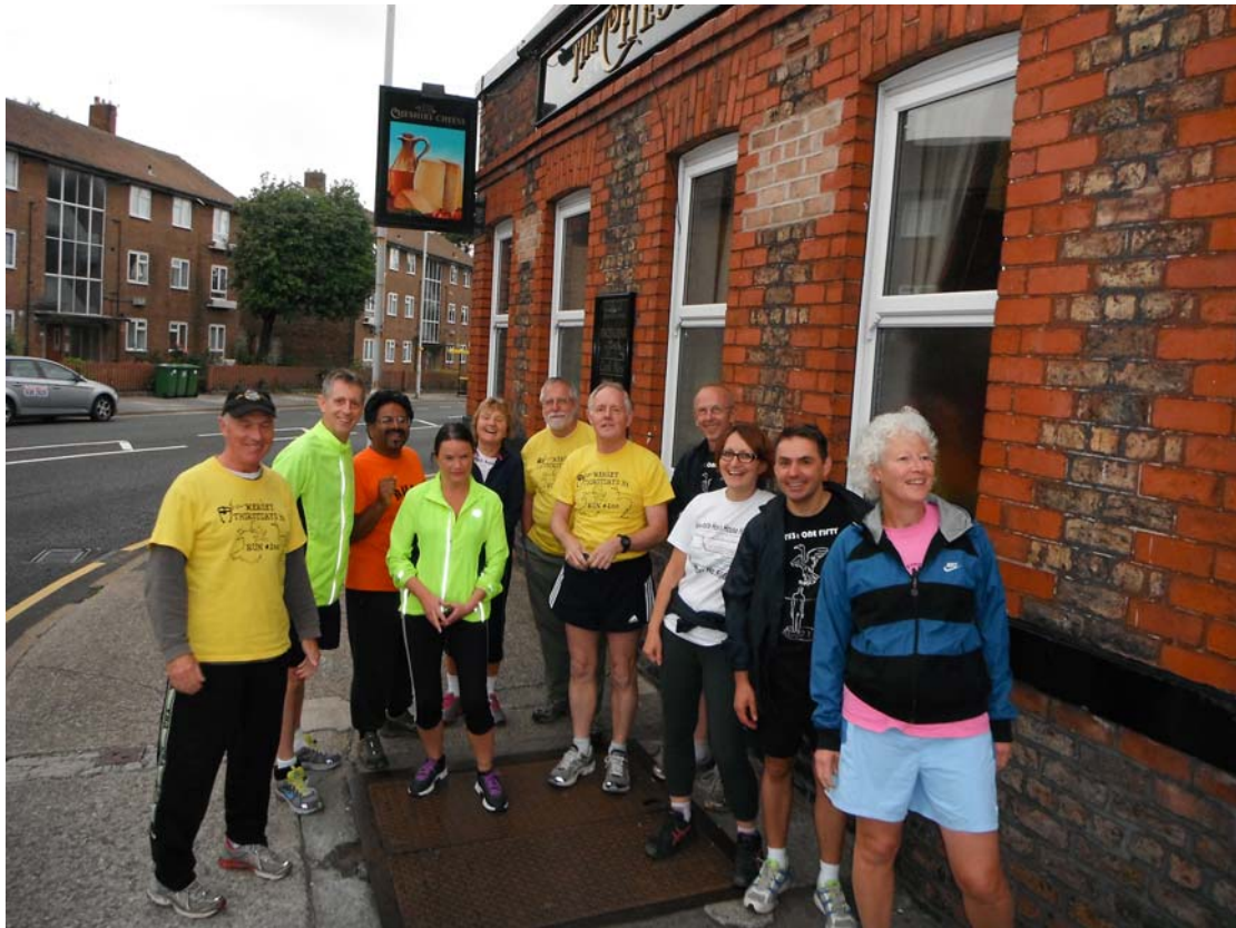
The standard Flash was preceded by this one

Pack 10" , Chico, Snoozanne, Mad Hatter, Compo, Overdrive, Cleopatra, Virgin on the Ridickulous (Hare), FCUK, Carthief, OTT, ET