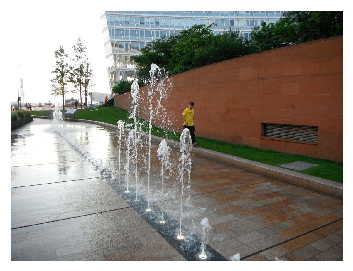
Water feature - L1