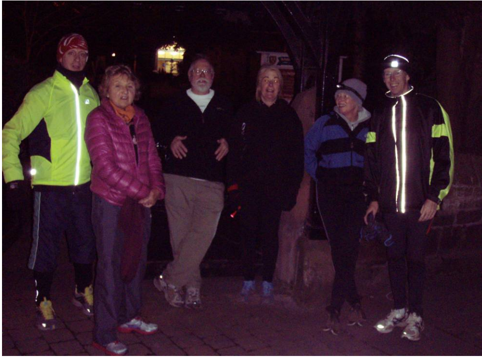
An appropriate sign