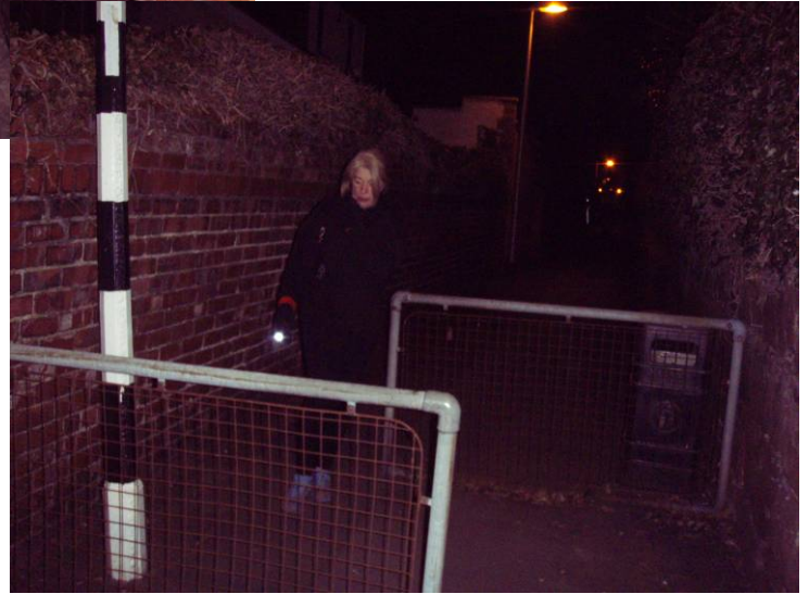
Along Meols Drive and Pinfold Lane to the