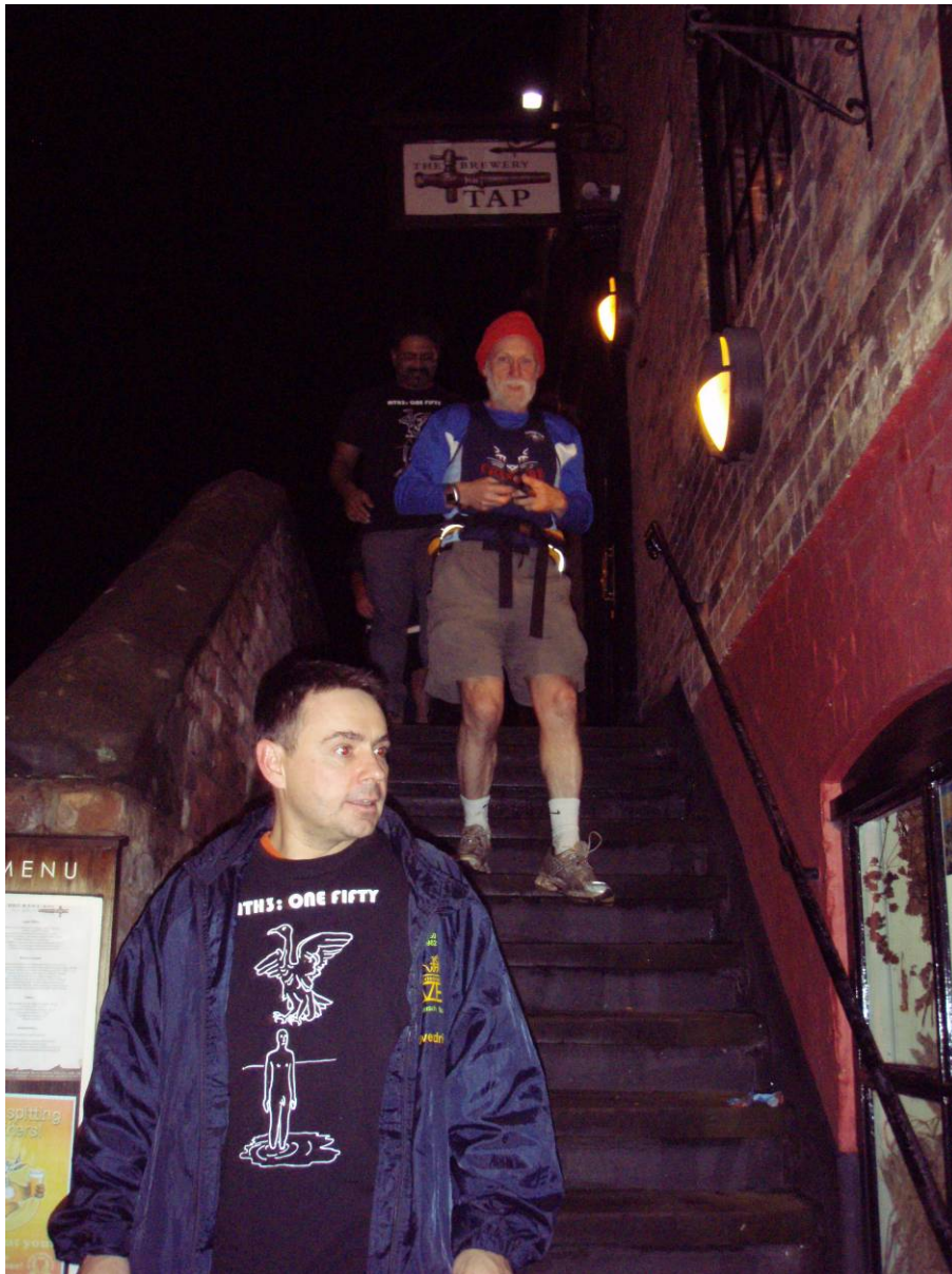
Leaving the Tap we headed up to the traffic lights and down