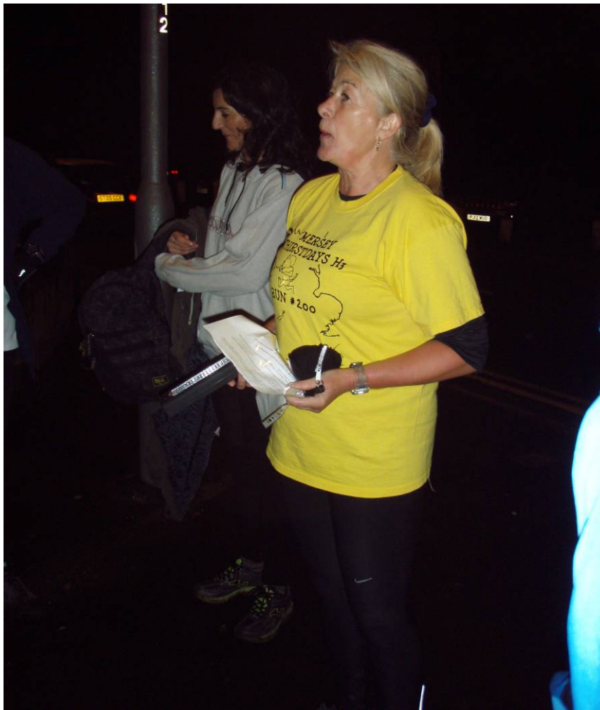
A Hash Flash

The Hare gave a lecture on the various buildings