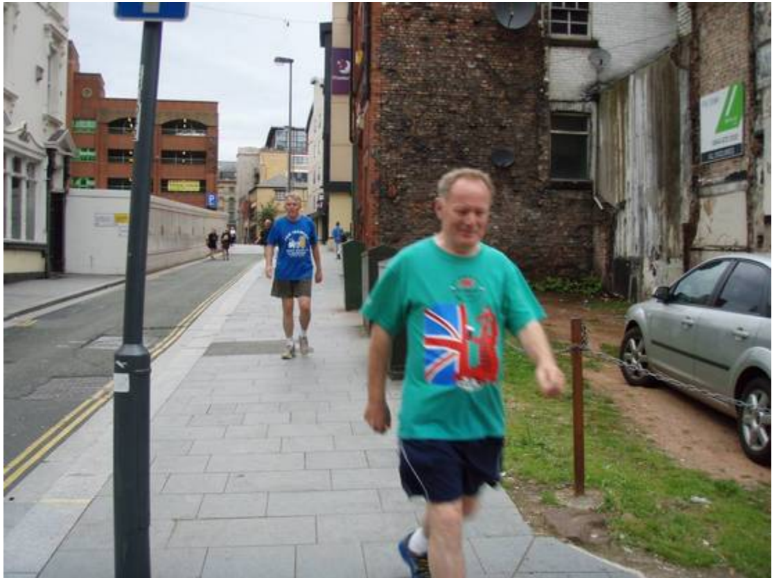
There was quite a tail back up the hill