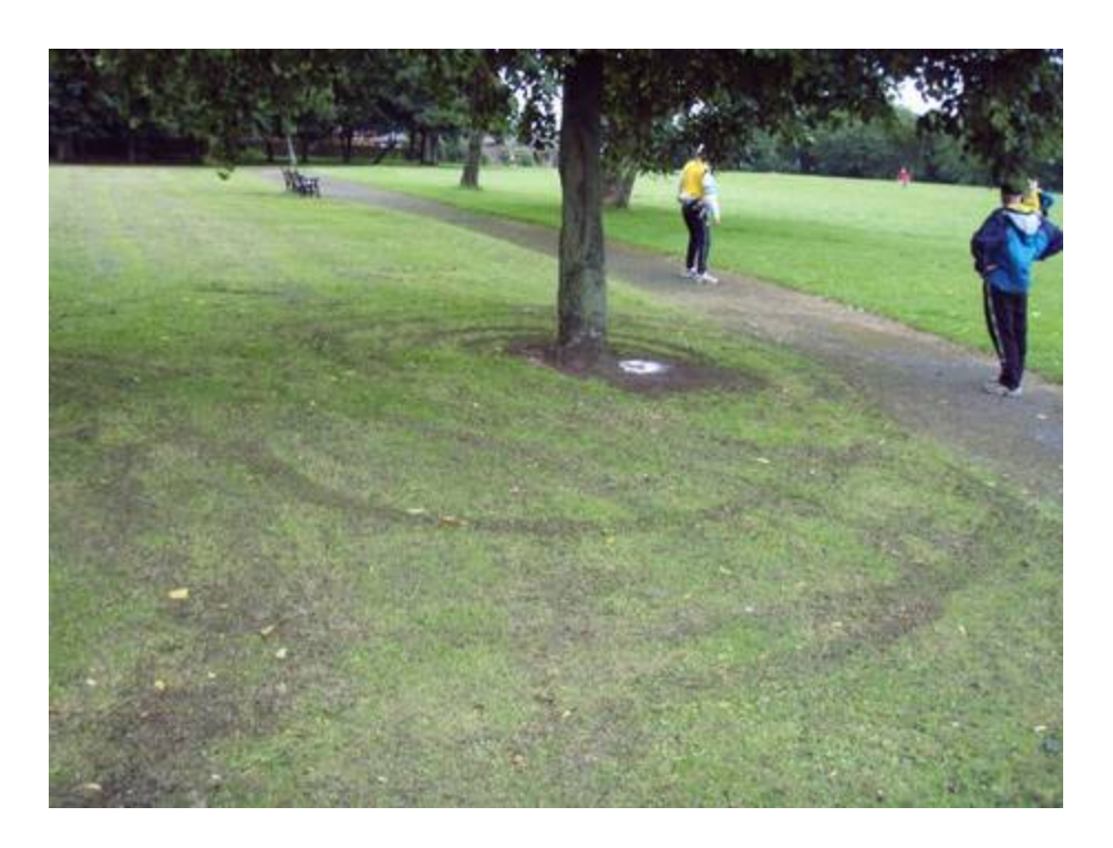
Clear across the Park to Elm Road and a less than ambitious sign