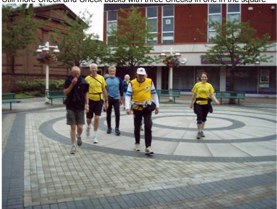
Through Birkenhead market and then

Still more Check and Check backs with three Checks in one in the square