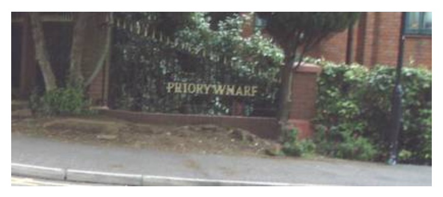
And there was a potential Darwin awards moment <a href="http://www.darwinawards.com/darwin/">http://www.darwinawards.com/darwin/</a>