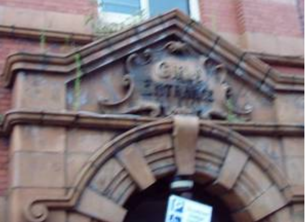
But despite our best efforts we could not find the Alternative Entrance