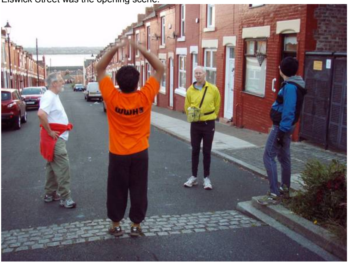
From the Wiki entry