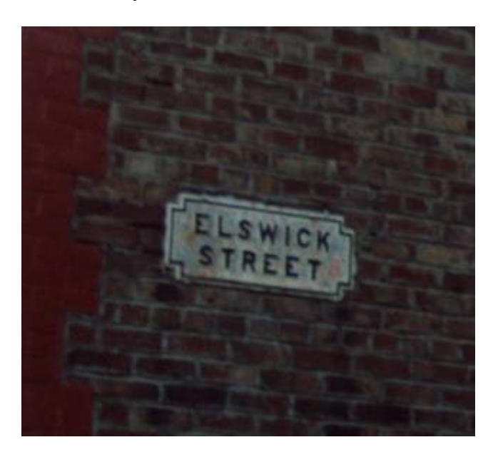
Those of you who were watching TV in the 80s in the UK may remember Bread <a href="http://en.wikipedia.org/wiki/Bread">http://en.wikipedia.org/wiki/Bread</a> (TV series)