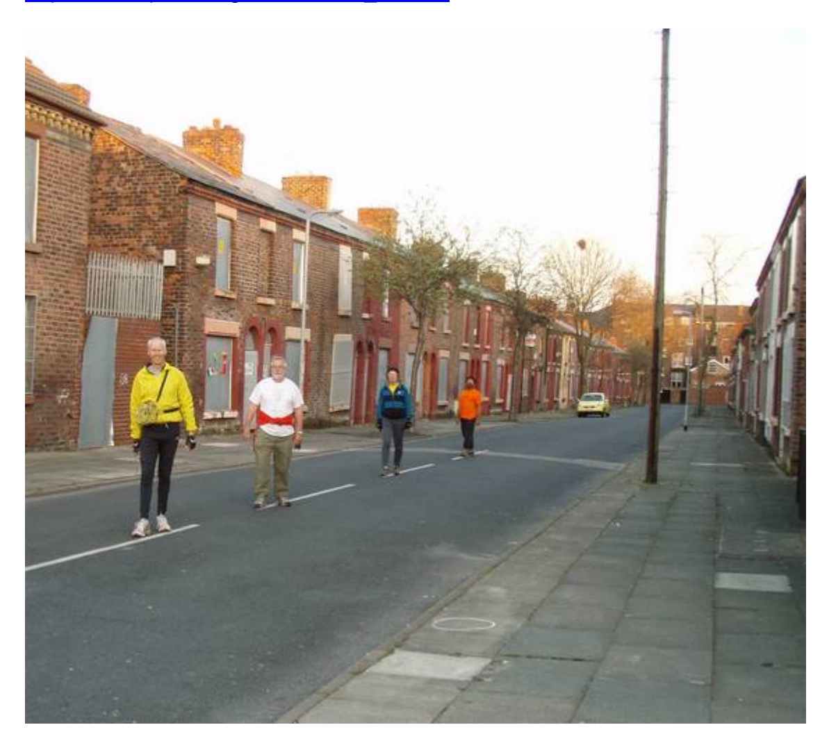
Several streets later and this curiosity presented itself

The deserted street gave us the idea of re-creating the Abbey Road scene but with very foreshortened zebra stripes and no Belisha beacon <a href="http://en.wikipedia.org/wiki/Belisha">http://en.wikipedia.org/wiki/Belisha</a> beacon