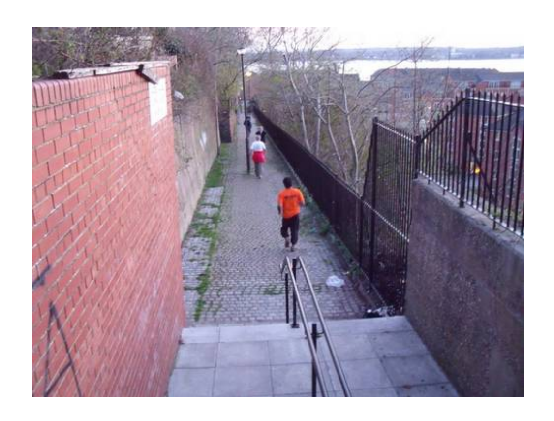
And we were on Riverside Drive after a small challenge