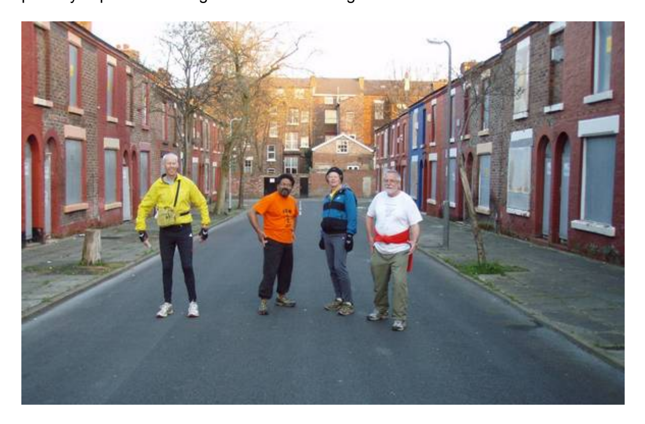
followed by FCUK making his usual mistake