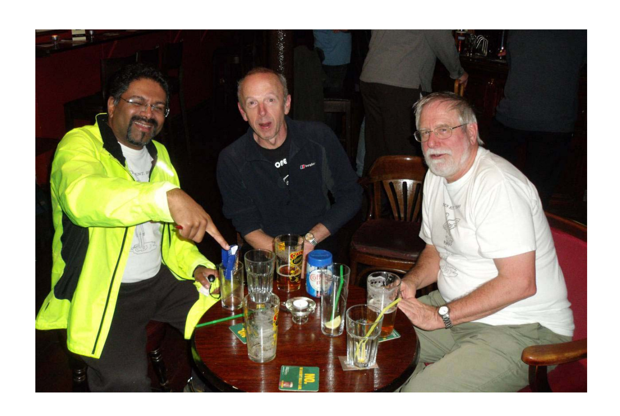
The Hash Cash Safe. - security is paramount