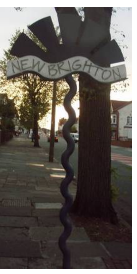
Several legstretchers later and the welcome sign