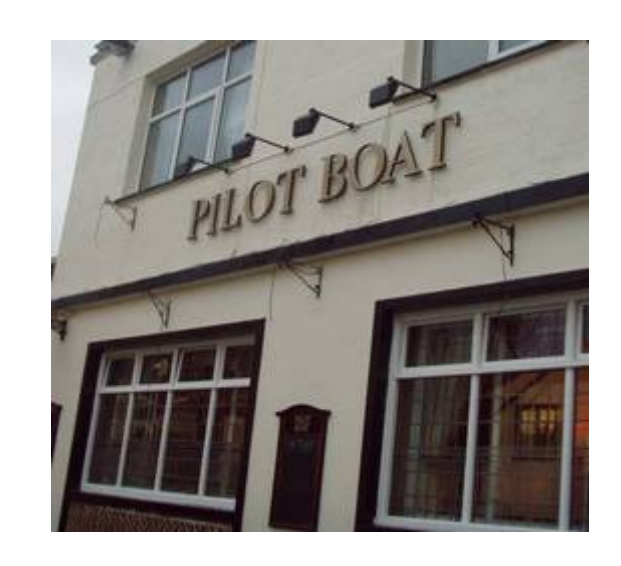
and the Pack refreshed