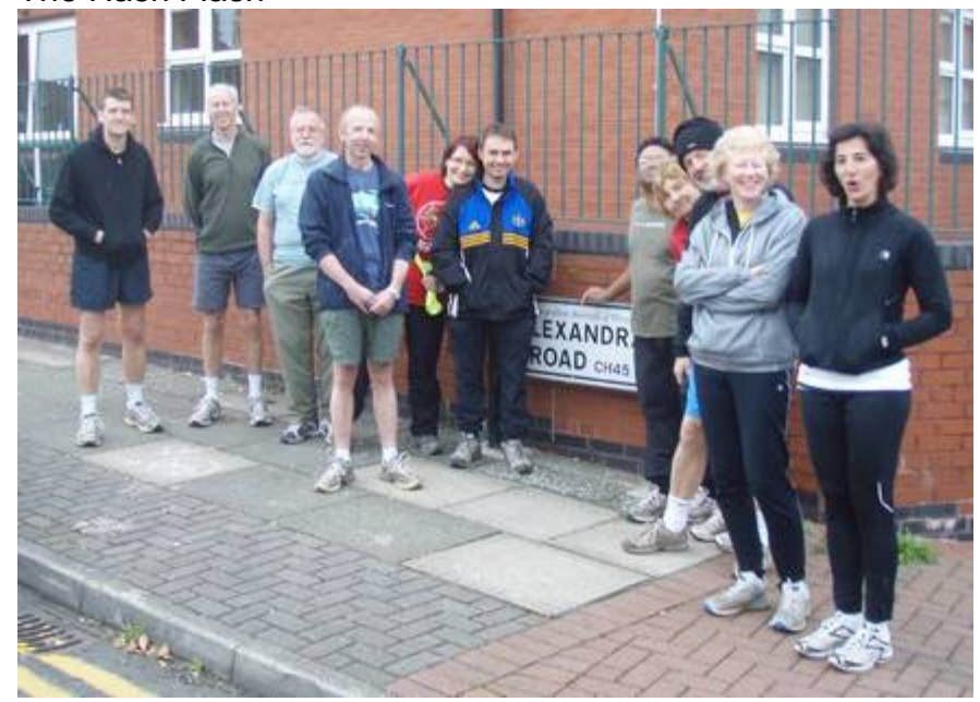
Down the hill