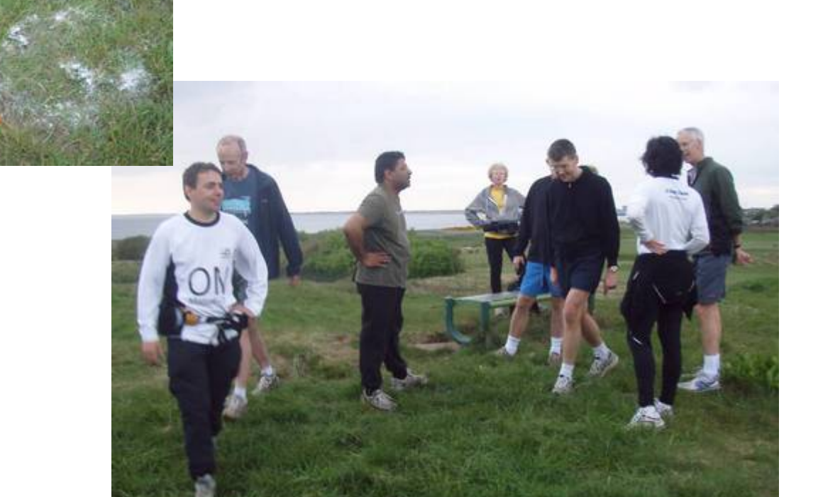
Back down to Sandcliffe Road and a loop back to Sea Road where the pack practiced their "Standing on a Check" prowess

With no one admitting serious injury we made our way to the top and a