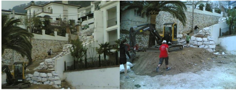
Up up and away, not long we climbed through a building site