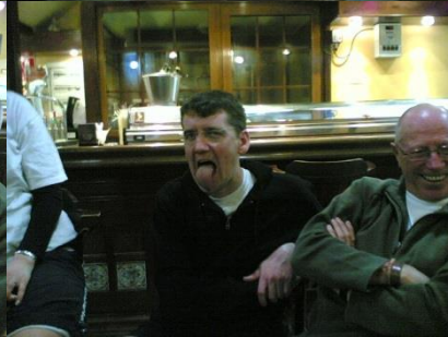
Sprog, Spanish cidre is known to cause excessive tongue growth...