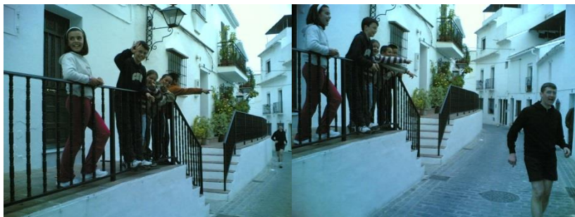
Local kids help us out (he went thataway....)