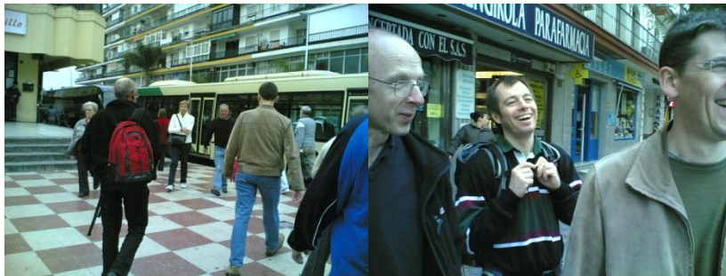
We rode the rails (train and tram) to the villa