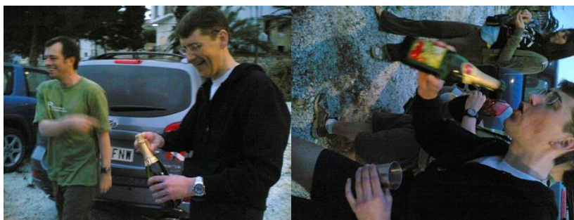
Sprog meets cidre, it was love at first sight...