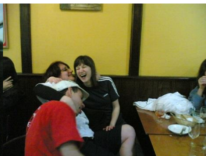
A hilarious evening ensued. This was a great hospitality from a Hash that also had Spanish members and knew some really good places in town.