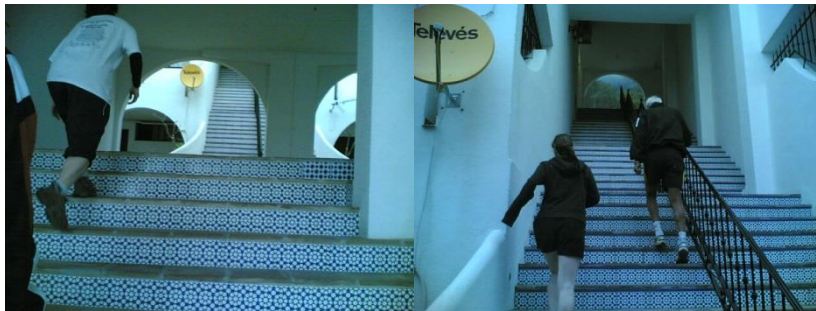
Then through a hill top village in the Mijas country