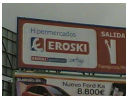
Wondered what sort of supermarket this was... Polish, Russian, heroic, erotic?