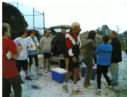
Down down a bit to the circle