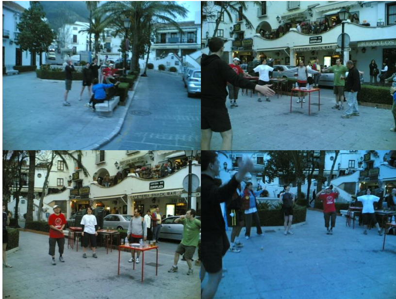
Finally a beer stop in the centre of the village, where Overdrive led a celebratory Vindobona H3-style dance