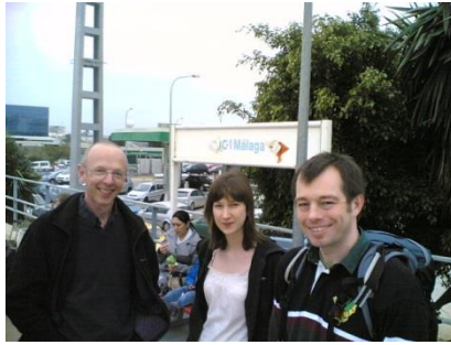
We found AP who had come in from another European country....