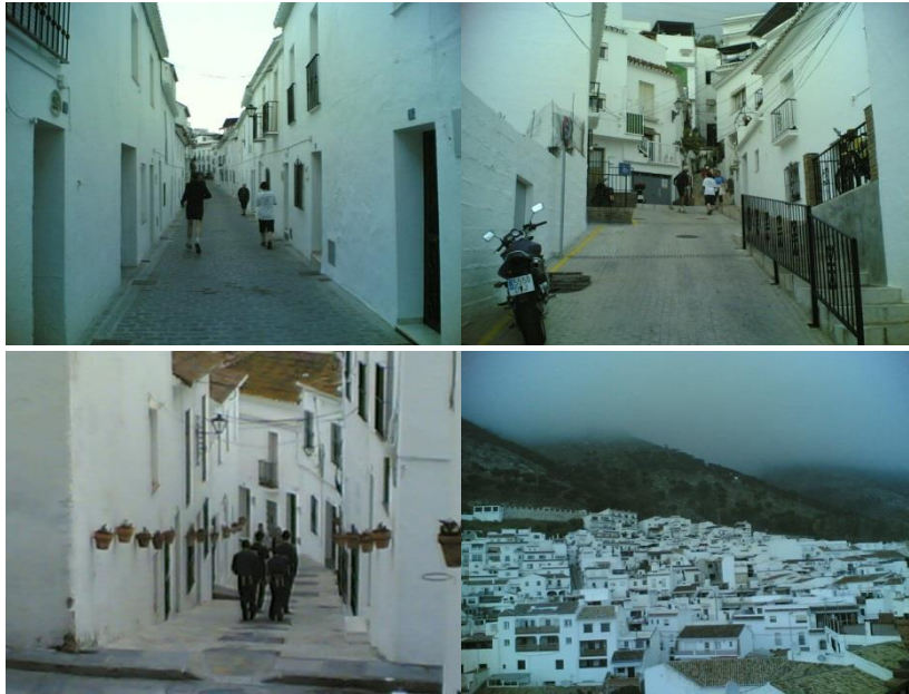
Genuinely beautiful village-scapes