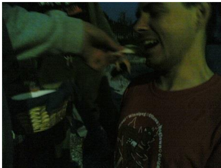
The initiation ritual involved fish. This was a dark, dark place...