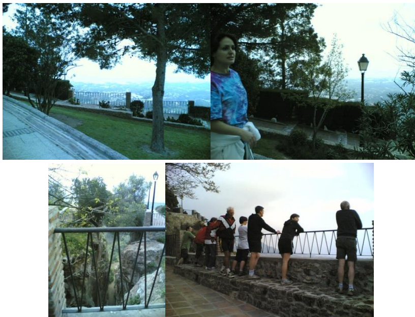
And views down to the coast from the 'sierra'