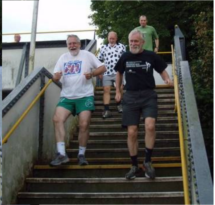
And onto a Check (is that a clue as to the direction?)